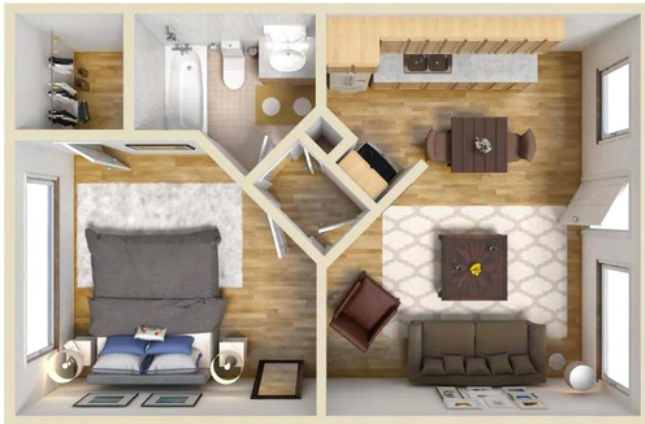
STANDARD 1 BED